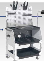
DENTSTATION Réf. 056848